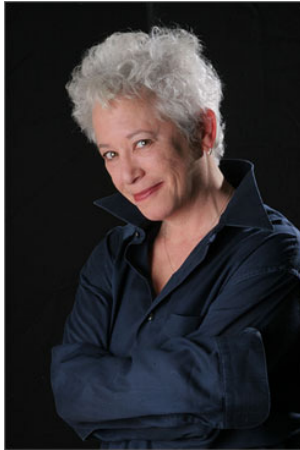
Enlarge

Updated 1d 14h ago | Comments 17 | Recommend 11 | E-mail | Save | Print | Reprints & Permissions | RSS